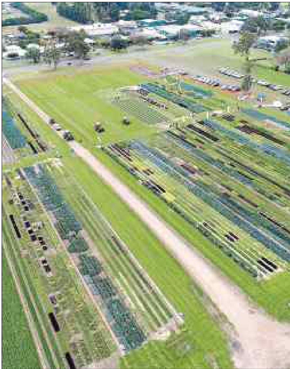
UNDERWAY: A bird's eye view of the East Gippsland Innovation Field Days at Lindenow, Victoria, showing the many variety trials.

And the online access to the data, learnings and insights will take on another dimension in the coming months, with a large library of professional videos produced from the event set to be hosted on the Ausveg website.