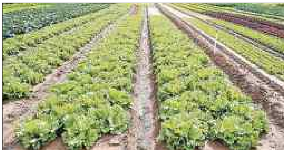
COMPARISON: Mycorrcin treated brassica seedlings on the left, untreated on the right at the EGVID.

The Mycorrcin treatment showed better root growth in seedlings while the application of Mycorrcin and Foliacin led to increases in lettuce and broccoli head weight at the following rates: